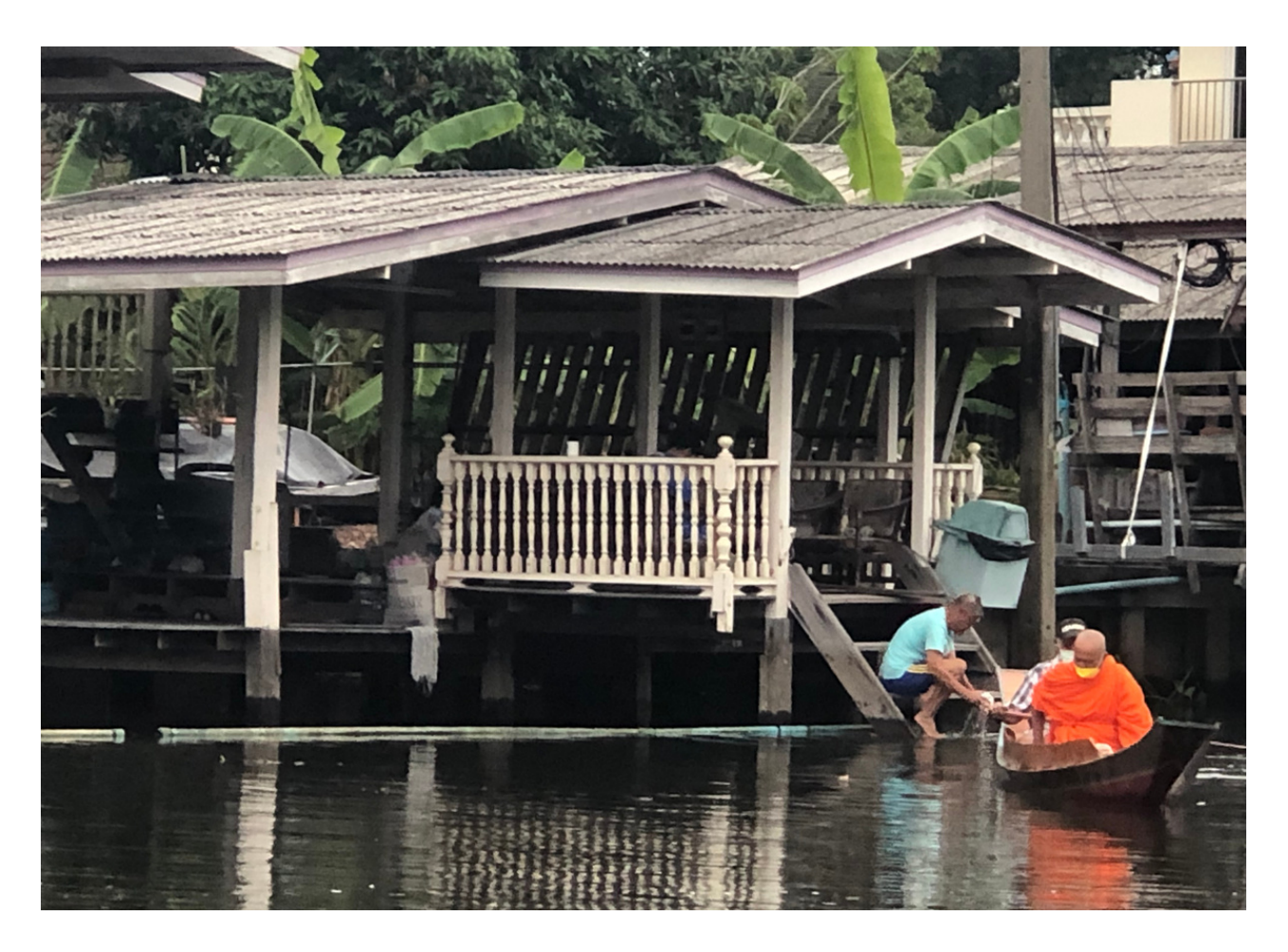
Image 3: Alms-giving ceremony in the morning at Wat Bot Bon community.