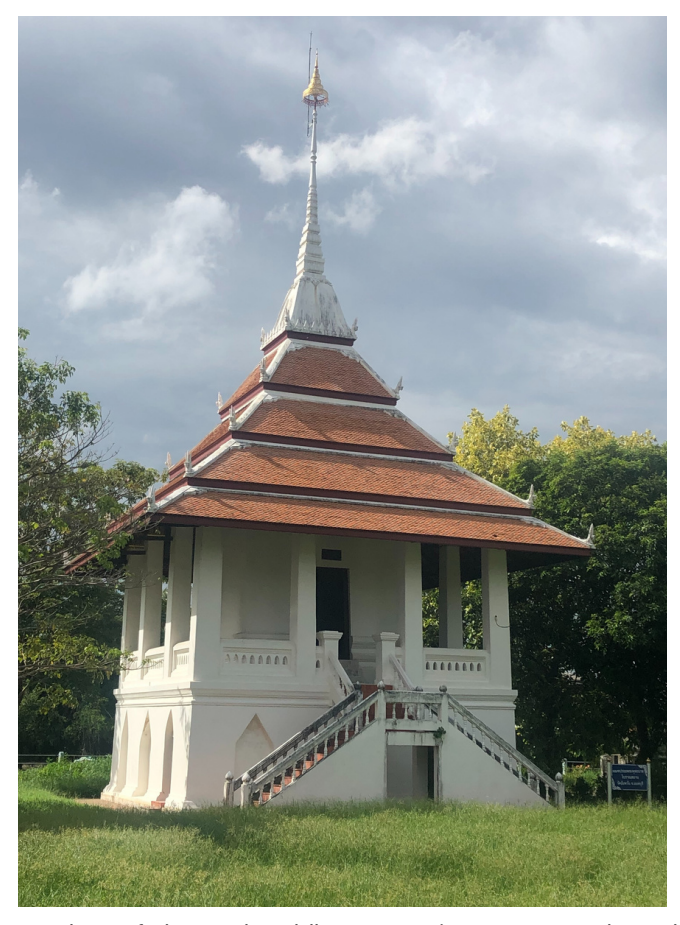
Image 1: the Mandapa of The Lord Buddha's Footprint at Wat Amphan, Khlong Om Non

The new definition of Bang Muang community and Wat Bot Bon community derives from historical capital and modern-day transformations, including urban expansion and transportation development. If the emergence of this new definition is to benefit both the original riverside community and urban residents seeking relaxation from economic and social fluctuations, stakeholders involved in neighborhood development should prioritize the social history of the area to exhibit the community's historical roots and enhance the quality and educational value of tourism, wherein tourists gain insights and memories, aligned with the trend of creative tourism. Developing the surrounding area to facilitate access to tourist sites and connect with other areas in the Khlong Om Non neighborhood is inevitably related to the history of communities in Bangkok. If the areas can be developed into nodes that bridge the relaxation areas of Khlong Om Non with those of other Bangkok communities, such as the Bang Kok Noi community and Khlong Chak Phra, through building networks between local government organizations and activity groups in the community, it will foster both tourism activities and the exchange of resources and knowledge in the long term.